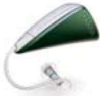
Delta Racing Green