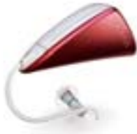
Delta Cabernet Red

...you probably imagine them to be big, bulky, beige “bananas”. But look at Delta: It’s tiny, triangular, and available in 17 vibrant colours. Its futuristic lines have already won a prestigious design award.