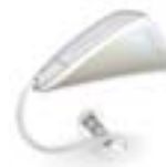
Mother of Pearl