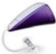
Delta Deep Purple